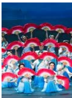
Chinese long-fan dance performance

This year's Chinese Culture Day is a grand event that happens in Melbourne Town Hall. Over 1700 students from Victorian Secondary Colleges participated in this event.